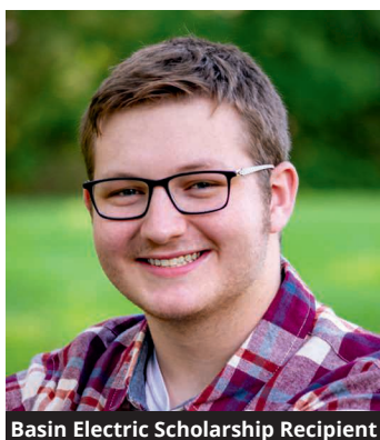
Basin Electric Scholarship Recipient

Each year, Lyon-Lincoln Electric Cooperative, Inc. demonstrates its commitment to community by awarding scholarships to deserving students in our service area. This year we were able to award ten Operation RoundUp® Scholarships to students from several area schools. The selection of the winners is based on SAT/ACT scores, grade point average, an application outlining high school/college honors, community and school activities, work experience,