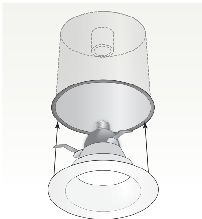
An LED retrofit kit installs in older recessed fixtures. Air sealing at this important leak point is an added benefit beyond the savings of the LED.

Recessed can lights present a large opportunity for improvement in most homes because they typically contribute a large percentage of the lighting electricity load and they are also primary areas for air leakage from the living space into the attic or into spaces between floors. LED retrofit kits are available that address both of these issues. By replacing both the existing bulb and trim with an integrated LED light and trim that is airtight, the fixture will become energy efficient, dimmable and will no longer be leaky.